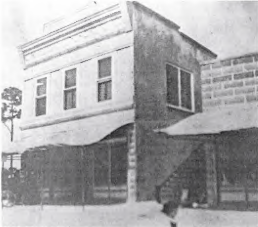
DuPuis Medical Office and Drugstore 6041-45 N.E. 2 Avenue West (front) and south facades c. 1907